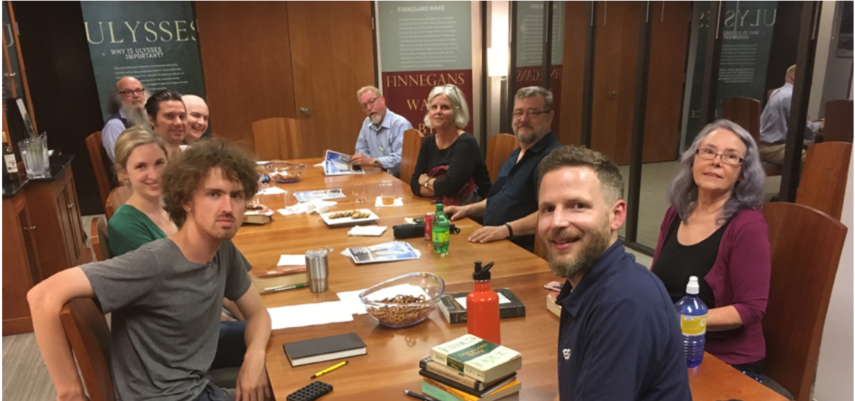
'Finnegans Wake' reading group, Austin, Texas