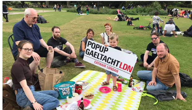
Pop-up Gaeltacht London

Ireland will support cultural expression among our diaspora.