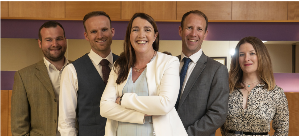
Back for Business mentorship programme for returning entrepreneurs