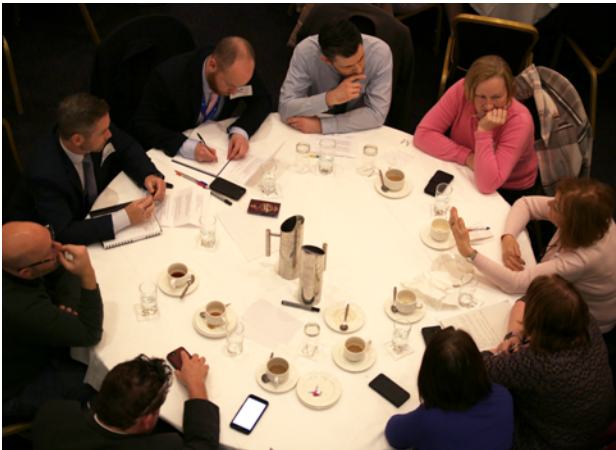
Diaspora strategy public consultation

Today, the Irish diaspora is a diverse and dynamic global community connected to Ireland through ties of citizenship, heritage and affinity, retaining a strong sense of Irish identity that has remained vibrant over the ages.