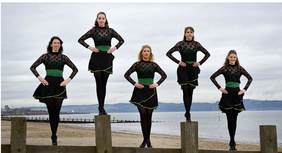
Edinburgh Irish Festival