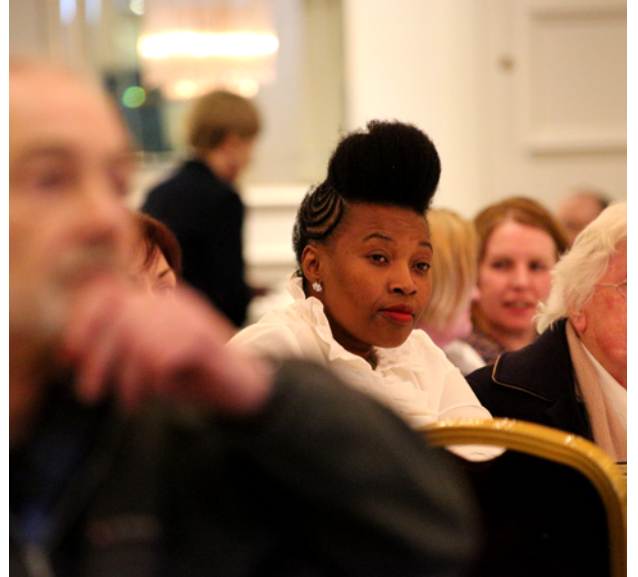
Promoting diaspora engagement