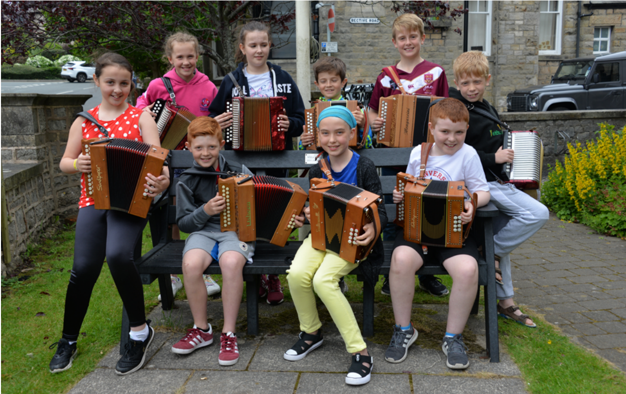
Under 12 participants at the All Britain Fleadh Cheoil, Kirkby Lonsdale, Cumbria