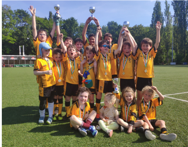
GAA youth tournament, The Hague