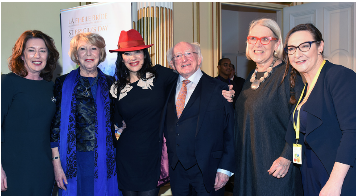
St Brigid's Day, London