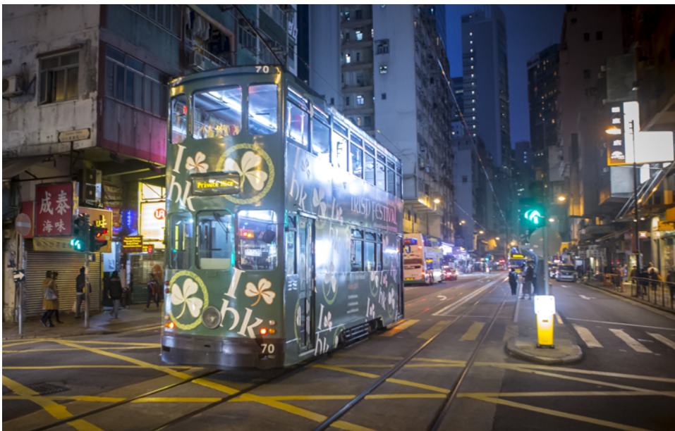
Hong Kong Irish Festival