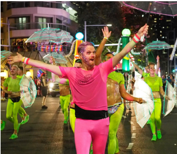
Sydney Queer Irish, Australia

Ireland will work with our diaspora to promote our values abroad and celebrate the diversity of our diaspora.