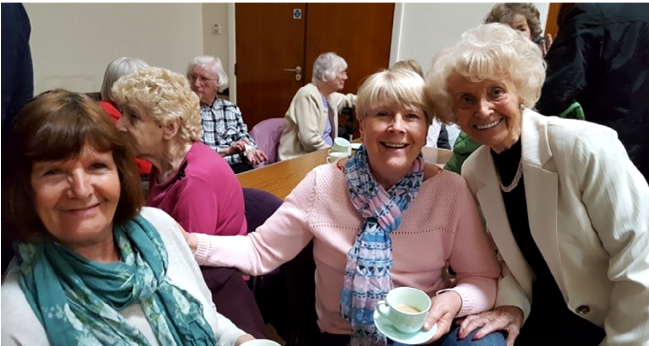
Raised on Songs and Stories, Tyneside, Britain

The Programme's primary purpose is to support the most vulnerable and marginalised Irish emigrants across the world. In addition, the Emigrant Support Programme supports the establishment of networks across the diaspora, such as groups and initiatives aimed at promoting ties to Ireland based on culture, sport, heritage, education and business.