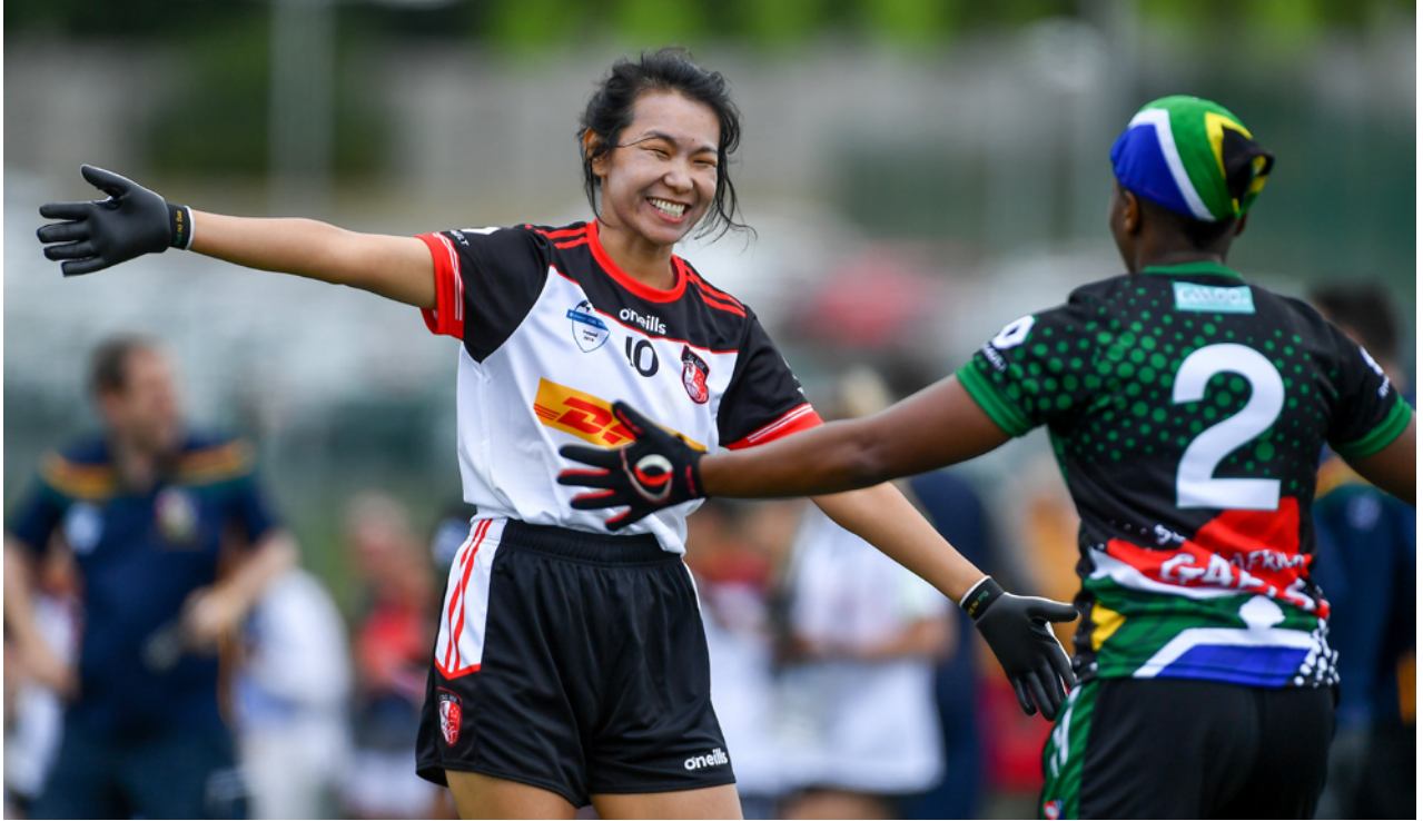
GAA World Games