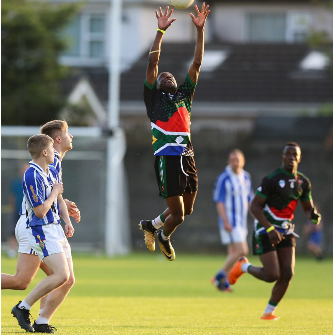
SA Gaels GAA