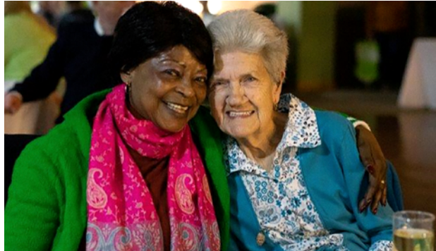
Luton Irish Forum

Ireland will ensure that the welfare of the Irish abroad remains at the heart of our diaspora support.