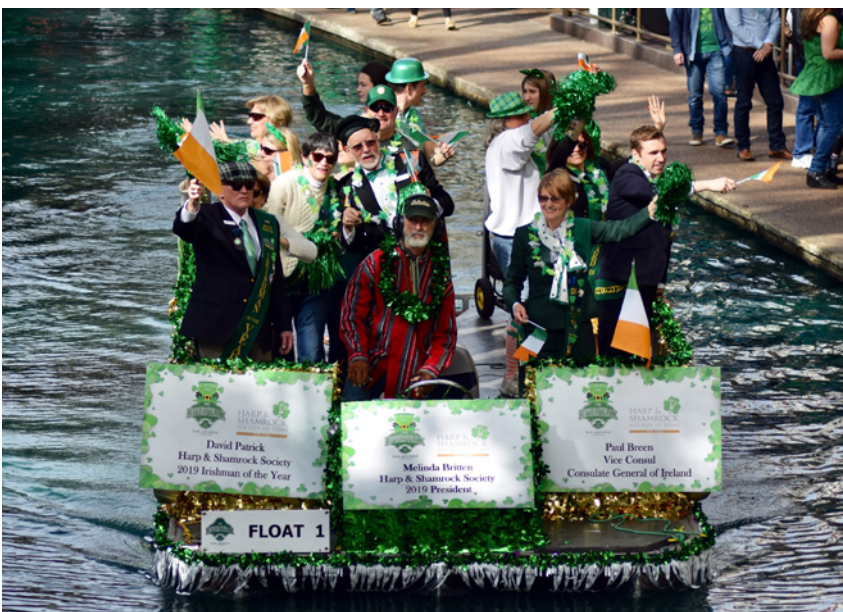
St Patrick's Day River Parade, San Antonio, Texas