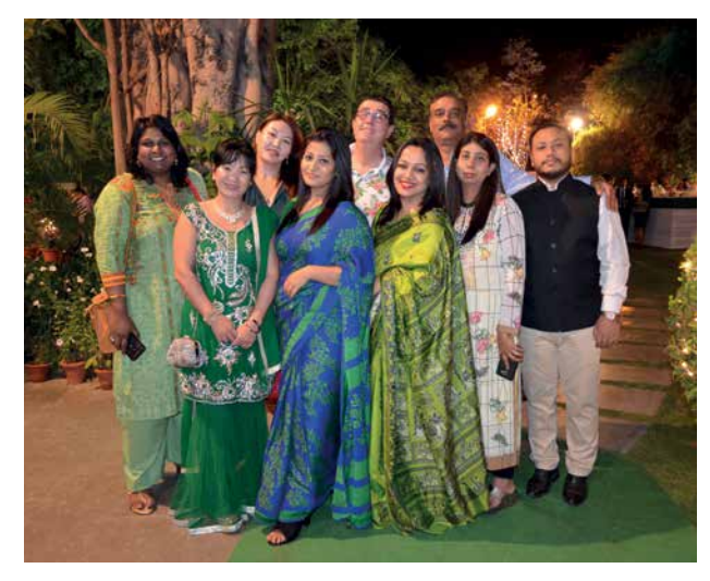
Embassy staff at the St Patrick's Day reception in New Delhi.

We will continue our support of voluntary, community, academic, cultural, sporting, business and other Irish organisations throughout Asia Pacific.