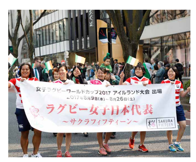
Japanese Women's Rugby team marching in the Tokyo St Patrick's Day Parade. Photo: © The Japan Times, 18 March 2019