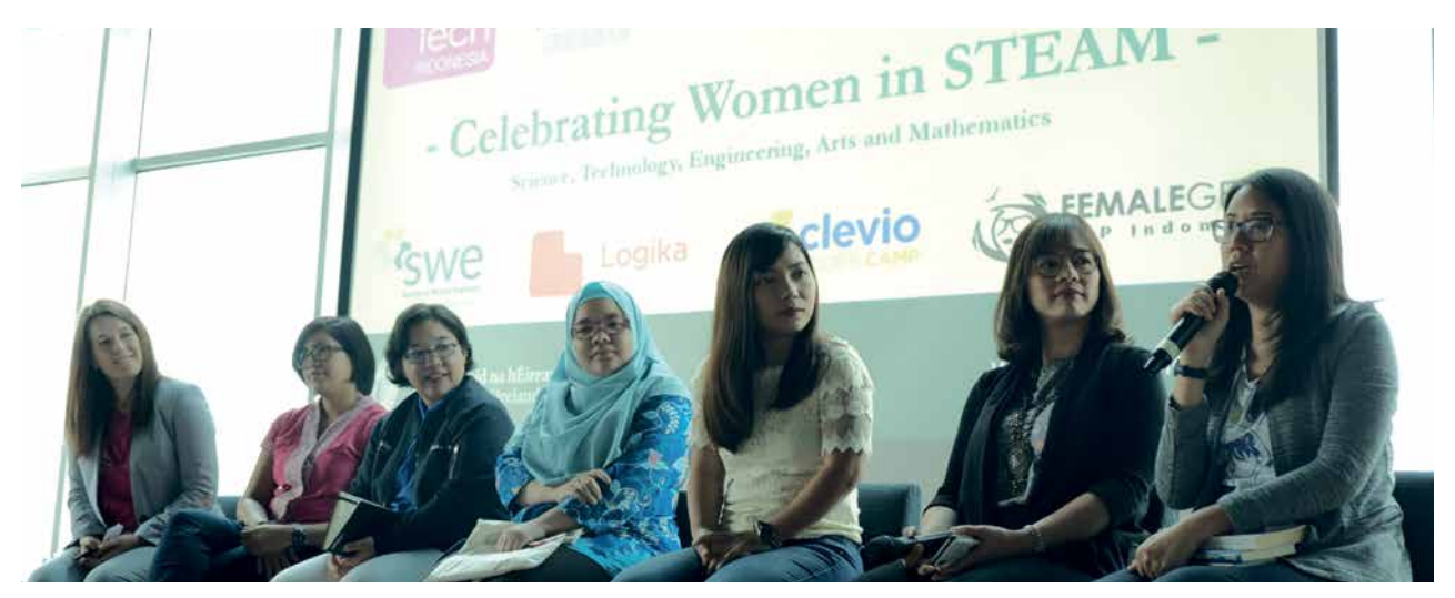
Women in STEAM panel, marking St Brigid's Day in Jakarta.

The region is already the primary driver of the global economy, contributing more than 60% of global growth, and it has seen a continuous expansion of its middle class, which is expected to number 3.5 billion people by 2030.