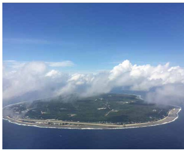
An aerial view of Nauru in Micronesia.

» Collaborate with the leading international financial institutions in the region, such as the Asian Development Bank and the Asian Infrastructure Investment Bank, and explore new partnerships to support their policy development and programme implementation, and to realise commercial opportunities.