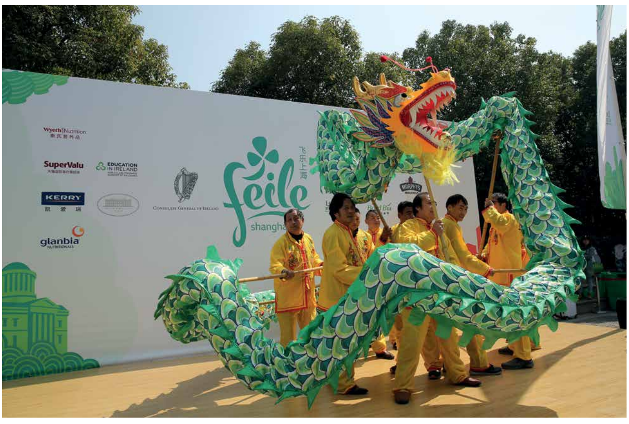
Performers at the St Patrick's Day Féile celebration in Shanghai.

Our membership of the EU provides much of the context for our engagement with the region at a political and strategic level, and we will continue to be an enthusiastic and engaged partner in shaping Europe's approach to the region. We will work with other EU member states and the countries of Asia Pacific in pursuit of a fairer, more just, secure and sustainable world.