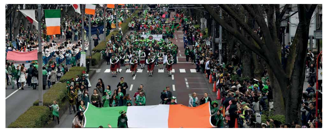
The Tokyo Saint Patrick's Day parade.