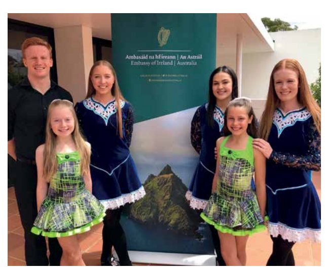
Dancers from the Simpson Academy of Irish Dancing in Canberra.

Cultural agencies will work more closely with our network in Asia Pacific to promote our music, literature and the performing arts amongst new audiences, including young people, in a region with its own rich and diverse cultural offering.