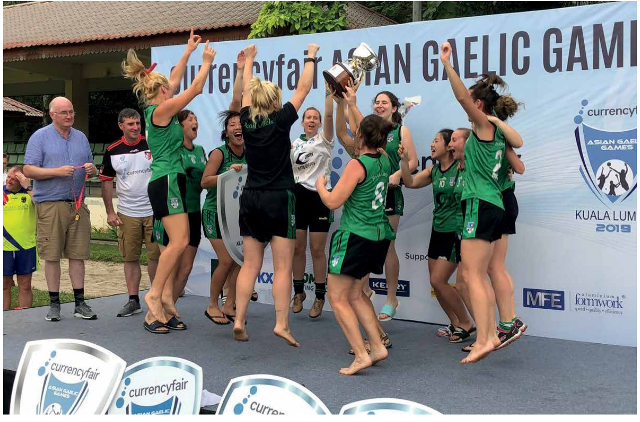
CurrencyFair Asia Gaelic Games in Kuala Lumpur.