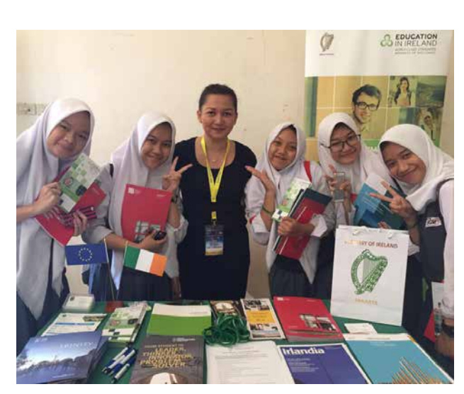
Indonesia, Education Fair.